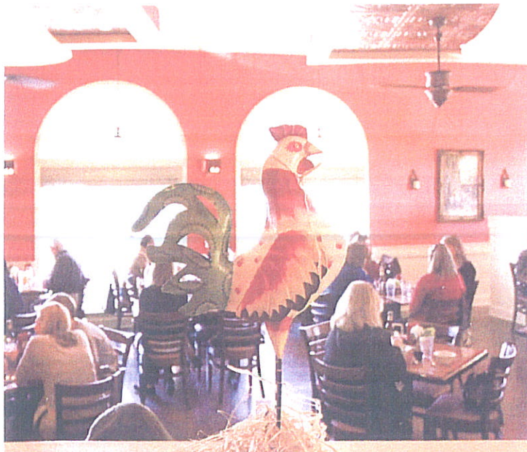
Another Broken Egg Café in Birmingham

Another Broken Egg Café is tucked into Mountain Brook Village just south of the city. Sibling owners Miller and Ashley Phillips brought experience from their parents' Destin, Florida, restaurant when they opened the eatery last fall. The café is a strong link in a regional chain known for the Southern Crab Stack ($13.99), a seasoned grits cake topped with a lump crab cake, and Biscuit Beignets ($4.49) served with honey-marmalade dipping sauce. As the weather warms, head to the patio. 2418 Montevallo Road; anotherbrokeneegg.com or 205-871-7849 (TURN THE PAGE)