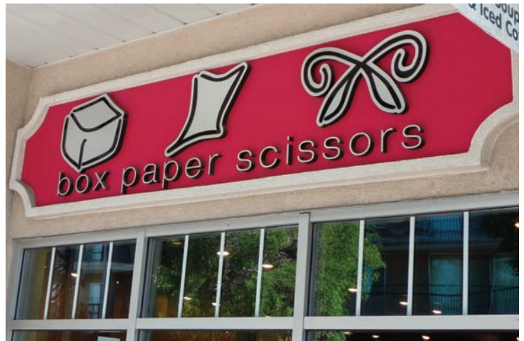
Great signs such as this one for a stationary store are eye catching and informational.

To maximize the impact of the program, the Alliance has created two Targeted Retail Areas (TRA) within the program boundary. These consist of ground floor retail tenants on Dauphin Street (between Water Street and Cedar Street) and