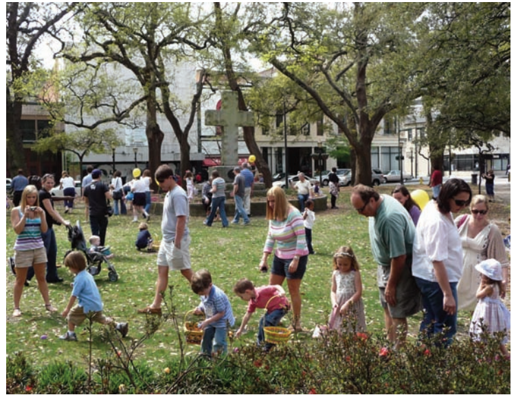
Events such as the inaugural Easter in the Squares help market downtown to a new audience.