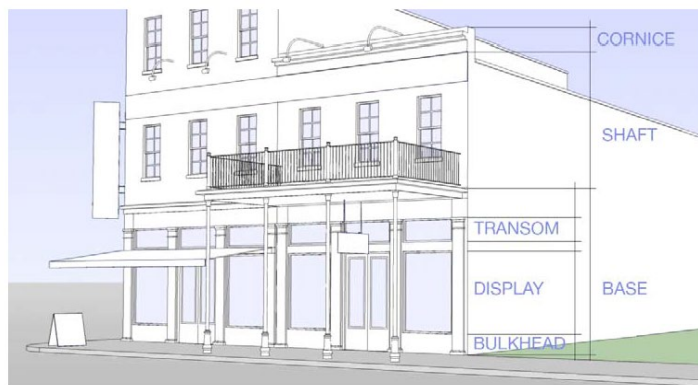
Figure A-10.1 Shopfront Elevation Elements

Cornice: Trim required at the eave or top of parapet. May include one or more habitable floors for buildings over 6 stories.